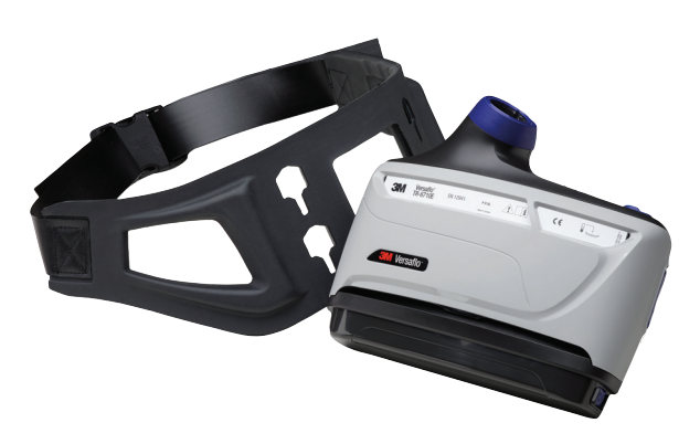
For information on protection factors, please see the data on the headtop used with the unit.

TR 600_EU_20pg_A4_Brochure.indd 11 05/07/2016 15:19