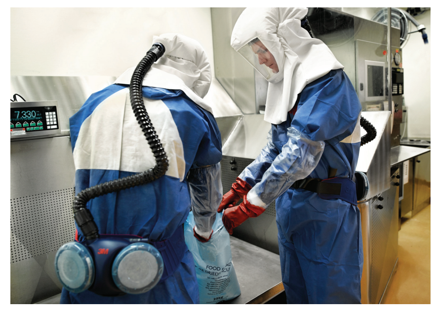
For information on protection factors, please see the data on the headtop used with the unit.